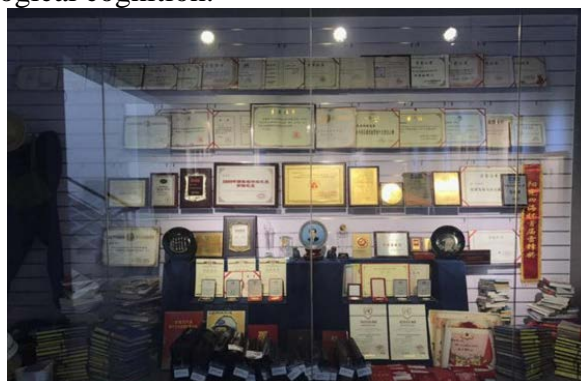
Figure 1 Ideological and political education in higher vocational English courses from the perspective of ecological linguistics

Public English is the most important part of vocational basic courses for higher vocational students. When integrating ideological and political elements into this course, it should be based on the students' actual development needs to ensure that the integration of professionalism and humanity is more organic. Under the background of information age, people's daily life production has been greatly changed by the application of Internet technology, and this development form also brings information service experience to students [1]. Therefore, for higher vocational colleges, we should actively promote the development of the school-based curriculum of ecology and language on the basis of paying attention to ecolinguistics, ensure that the attention to the network environment culture is fully reflected in the public English curriculum, ensure that the classroom teaching can better cater to the students' interests and create favorable conditions for the correct formation of students' ideological cognition.