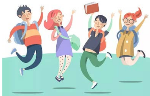
Figure 2 Active and innovative teaching methods promote active classroom learning atmosphere